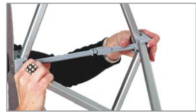
The system locker makes assembly easy.