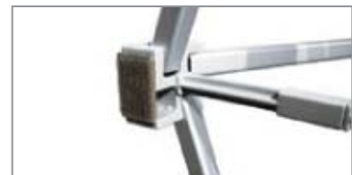
Side attachments for extending the image across the sides are standard on all frames.

There are occasions when you need to move quickly and still be as cost-effective as possible. At the same time it is important to put across your message in a powerful and convincing way. This is when Soft Image comes into its own right.