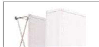
Choose between an image on the front only or both the front and sides.