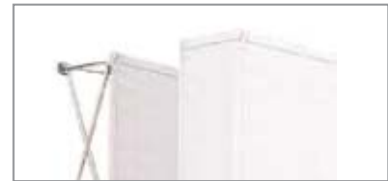
Choose between an image on the front only or both the front and sides.