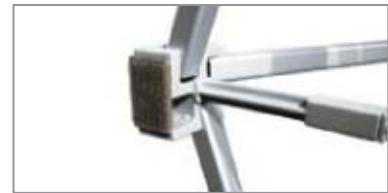
Side attachments for extending the image across the sides are standard on all frames.

There are occasions when you need to move quickly and still be as cost-effective as possible. At the same time it is important to put across your message in a powerful and convincing way. This is when Soft Image comes into its own right.