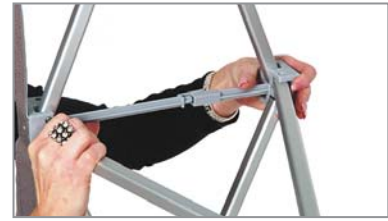
The system locker makes assembly easy.