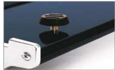
The stand can be adjusted to compensate for uneven floors.

Sometimes you need to be ready for a presentation at a moment's notice and still be able to put across the message with a touch of exclusivity. The Roll Up Professional is perfect for such moments, as it is the most exclusive banner system in its class. In less than a minute you have a ready-assembled display system where the design and quality are far beyond the norm.