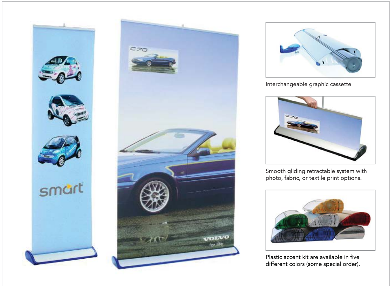
Interchangeable graphic cassette