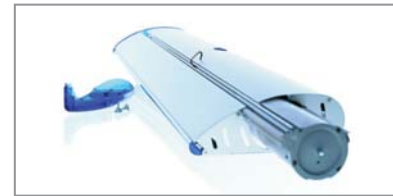
Interchangeable graphic cassette