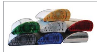
Plastic accent kit are available in five different colors (some special order).

Get instant marketing anywhere within 30 seconds, with the QuickScreen 3! This dynamic retractable banner system is the first on the market designed with interchangeable graphic cassettes. Its stream-lined body and cassette system allows you to change images on-site, while building a library of reusable graphics for the future.