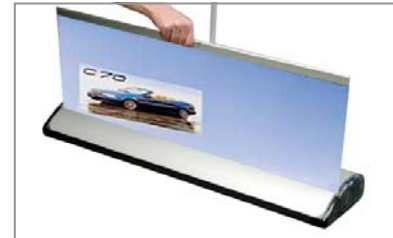
Smooth gliding retractable system with photo, fabric, or textile print options.