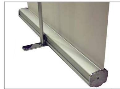
The pole is now placed directly into the foot (instead of the base), which makes the design and size of the base more slender, as well as offering more product stability.

MediaScreen 1 is a slim, user-friendly retractable display with an attractive design, which accommodates your need to easily and quickly set-up your message. The telescopic pole also adds to the ease of set-up, allowing you to adjust the height of your graphic.