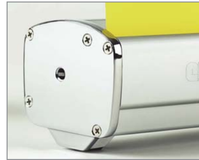
Slim, user-friendly retractable display.