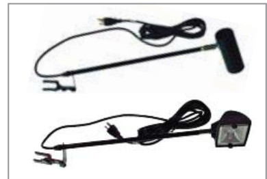
Accessories include 75 Watt Floodlights or 200 Watt Halogen Lights.

Are you looking to gain maximum attention with minimal effort? Then the Focus Fabric Pop-Up Fabric System is the answer for you. Large-format dye sublimation brings full color graphics to your audience in an instant, with this extremely easy-to-assemble display system.