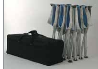
The system includes a frame, fabric graphic, Velcro perimeters and bag.