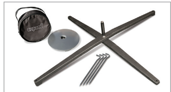
The weighted base offers stability and easily folds for transportation. For added stability, there is an extra weight available for placement in the middle of the weighted base (recommended for tallest flag). Optional stakes are also available for soft surfaces like snow and grass.

FlagStand is a lightweight, portable flag stand that is perfect for all outdoor events, marketing activities and campaigns. It is very stable even in strong winds and can be used in most weather conditions. This free-standing flag stand is available with a weighted base or with a ground stake and can be used on most surfaces such as snow, asphalt and grass.