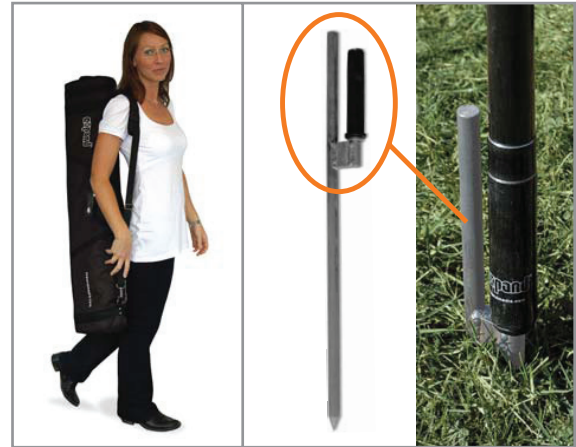
FlagStand is delivered in a nylon bag for easy transportation. And a ground stake is available as an option to the weighted base.