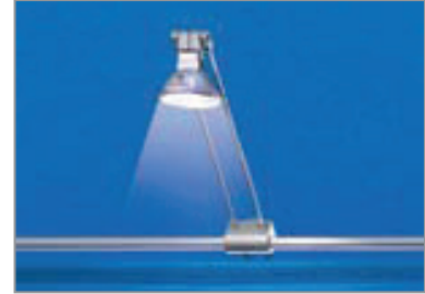
Integrated lighting system is available as an accessory.